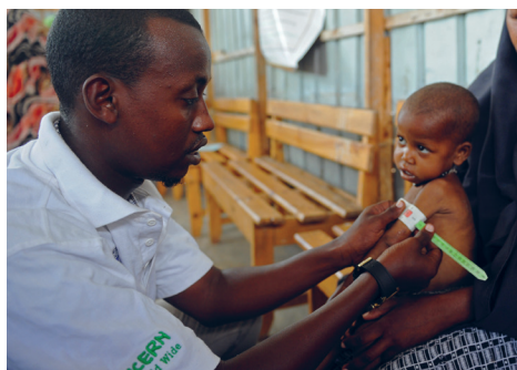
Gifts in Wills are helping our teams end hunger in the face of natural disasters.

This is the incredible difference you could make. Natural disasters are inevitable but, when they strike, a gift in your Will can help save lives.