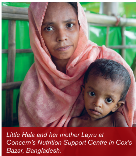
Bangladesh, 2017.

Thankfully, the generosity of Concern supporters meant we were there on the ground to provide emergency food to