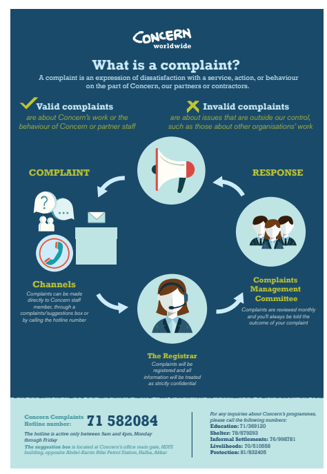
Figure 1: Poster used by Concern in Lebanon to communicate to programme participants about the CRM and referral system (referral contact numbers are mentioned in the lower right-hand corner).

Concern has been carrying out referrals in Lebanon since 2013. The team linked in with the relevant sector working groups to access existing service mappings, and developed a service mapping for the country office areas of operation to fill any gaps in the available information. Inter-agency referrals were carried out using the Interagency Referral Form. A Standard Operating Procedures (SOP) document was developed