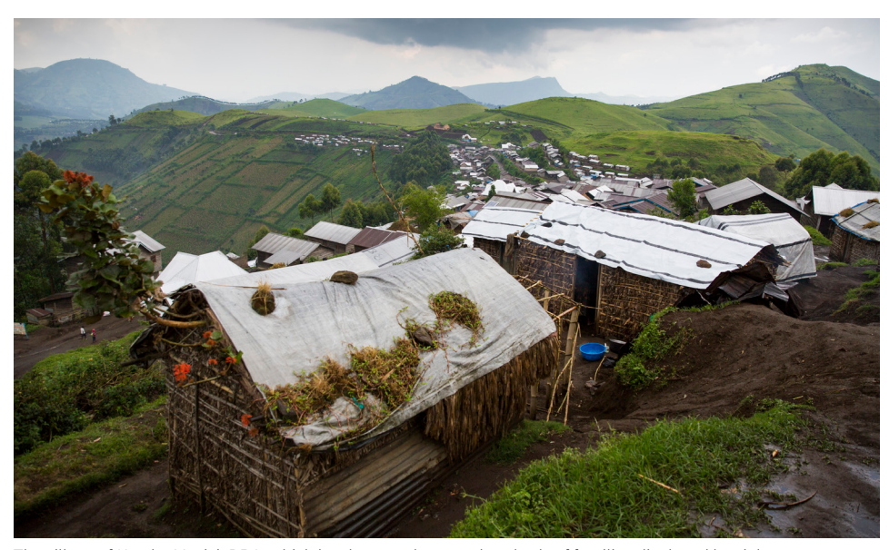
The village of Katale, Masisi, DRC, which has become home to hundreds of families displaced by violence.

context, protection risks are multiple, short-term emergency responses are insufficient due to protracted crisis and implementing longer-term development programmes remains a challenge due to the volatile situation and continuous population movements. Concern Worldwide has been working in the DRC for 25 years and recognises the need for programmes adapted to this complex operational environment and that seek to prevent and reduce protection risks to populations affected by insecurity and conflict.