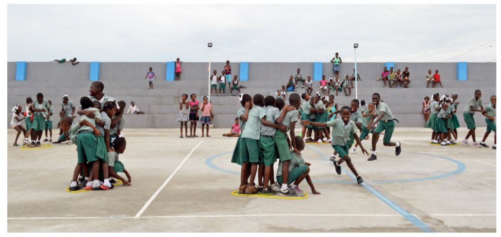
Game on child protection, Belekou, Haiti. June 2019.

used to feel the same as they did just now? How did "the catcher" feel? And also, which safe places do they have in their lives, in their communities? Can it happen that these places become unsafe?