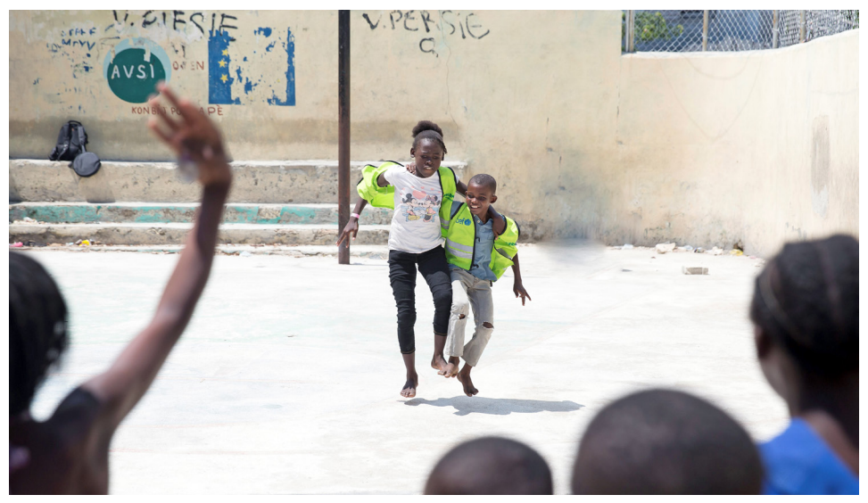
Game on Equality, Cité Soleil, Haiti. August 2019.

The sport related activities may look simple, but in fact we have learned that they provide an important platform for children to practice a number of social skills, including mutual assistance, sustained efforts to reach goals, respect for others and equal participation. Those are crucial for these children to navigate the challenging and complex social dynamics in their neighbourhoods of Cité Soleil.