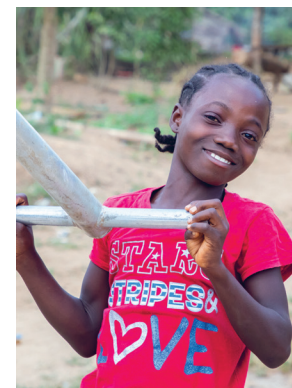
Darling Girl (10) using the new well in Toe Town, Liberia. Concern recently installed this well, and it's already having an incredible impact!