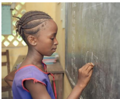
Class 1 student at Benevolent Islamic Primary School in Makinh Sierra Leone 2015