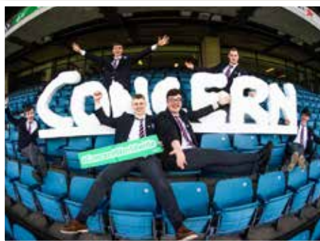
Students at Agents of Change

For help with motions or a quick response check out our twitter @concerndebates