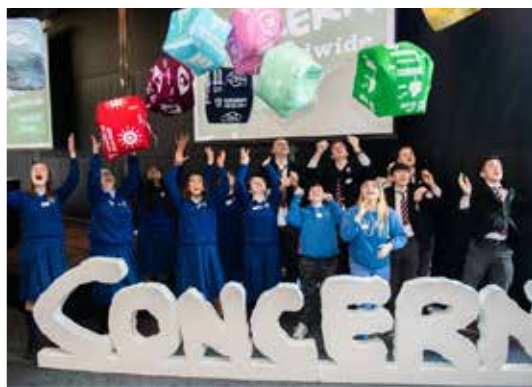
Students at Agents of Change event 2019 in Croke Park.