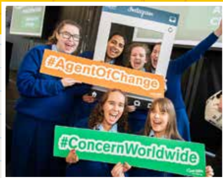
Students at Agents of Change taking part in a Project Us Café

The third part of our TY Academy Programme: a fun and motivating session for all participants to showcase their projects and receive career talks from interesting professionals.