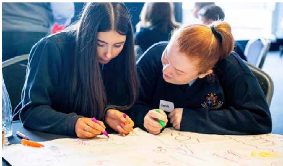
Students working on action projects at Agents of Change, Photo Ruth Medjber, 2019

WHO: You can sign up as many students as you like from individuals to an entire class, or even the whole school. It can be used as a stand-alone project (1 st year to 6 th year), or embedded into CSPE or Politics and Society courses.