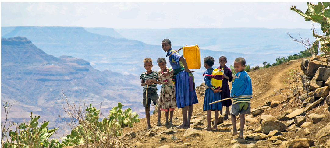
A group of children collecting water in the Amhara region, Ethiopia 2016.

A combined effort on the part of the Ethiopian government and donor partners contributed to averting a major humanitarian catastrophe. The impacts of climate change have never been more evident.