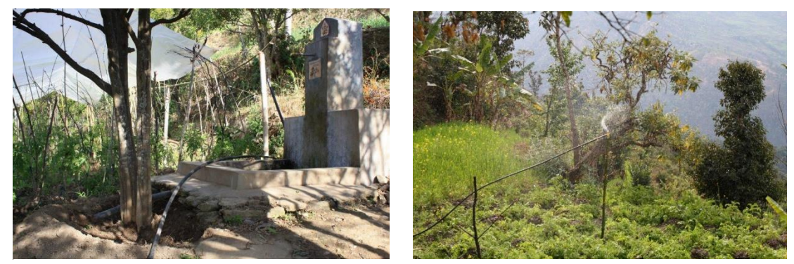
Figure 5 Tap stand in close proximity of a garden with possibility to use the overflow for irrigation (left); irrigation of a vegetable garden through sprinklers (right) in Nepal Domestic PLUS programme.

In Nepal, the sources of water are plenty and communities' water demands and needs always extend beyond that for just domestic water. In 2009, Concern in collaboration with two national partners (Nepal Water for Health and Karnali Integrated Rural Development and Research Centre) helped communities to improve the productive use of domestic water resources around the household. The programme focused on the homestead land community level and aimed at providing multiple sources of water for multiple uses. The intervention established an improved community water network able to provide access to more water that was closer to the household. This allowed the establishment of a range of small-scale activities that enabled people to grow more and more diverse food for household consumption and sale, keep livestock, and rear fish, among others. The main technologies piloted in the Domestic PLUS programme included ram pumps, rope pumps, rainwater harvesting, irrigation ponds, drip and sprinkler irrigation, and improved water mills. Depending on the water source capacity, the programme also promoted productive uses at community level, like medium scale irrigation for fields located away from homestead as well as small-scale electricity generation. The below pictures show the ranges of water services provided through the programme.