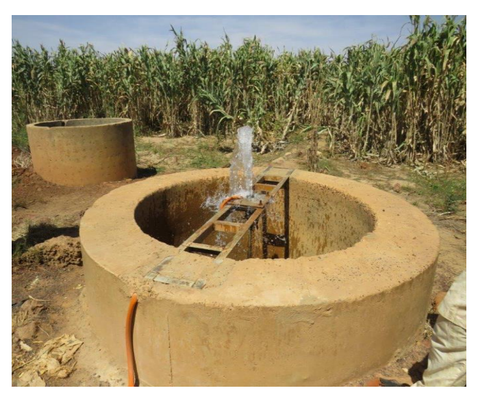
Figure 1 Water well functioning through solar power, Bambeye, Tahoua Region, Niger. Photo taken by Cecilia Benda (Nov 2019)

Irrigation can greatly contribute to improved food security, by enabling crop production during the dry season or by satisfying crop water needs during short dry spells. However, the irrigation scheme needs to be developed using accurate hydrological assessments where water in-flows (recharge) and outflows (irrigation) based on field size, crop water requirements, soil and climate are analysed. Under Irish Aid funding (2017-2022) Concern Niger developed large-scale solar-powered irrigation schemes to promote vegetable production during the dry season. A number of deep wells were dug in each irrigation site with water pumped into a network of underground pipes to distribute water to the vegetable plots. However, during the first irrigation season some of these wells dried up before the end of