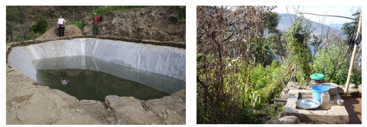
Figure 6 Fish pond (left); washing area with overflow directed to a nearby garden (right) in Nepal Domestic PLUS programme.