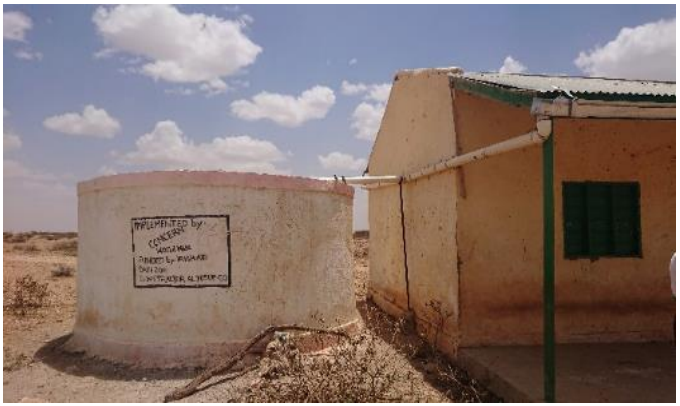
Figure 8 - Rainwater harvesting concrete tanks for schools to provide water for students and teachers. During dry periods, the water is also used to provide water to the larger community. Photo taken by Martin Findlay (April 2019).