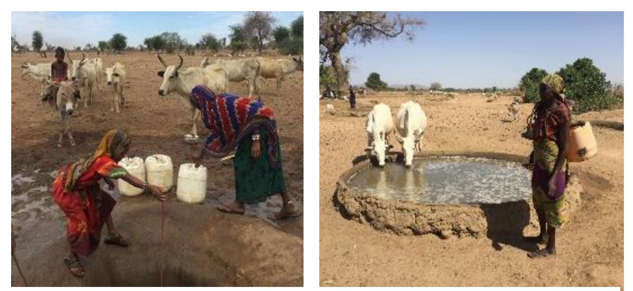
Figure 2 Artisanal water well in Tabita (left) and water trough/ man-made reservoir for animals (right), Sila Province, Chad. Pictures extracted from Marshak et al. 2021