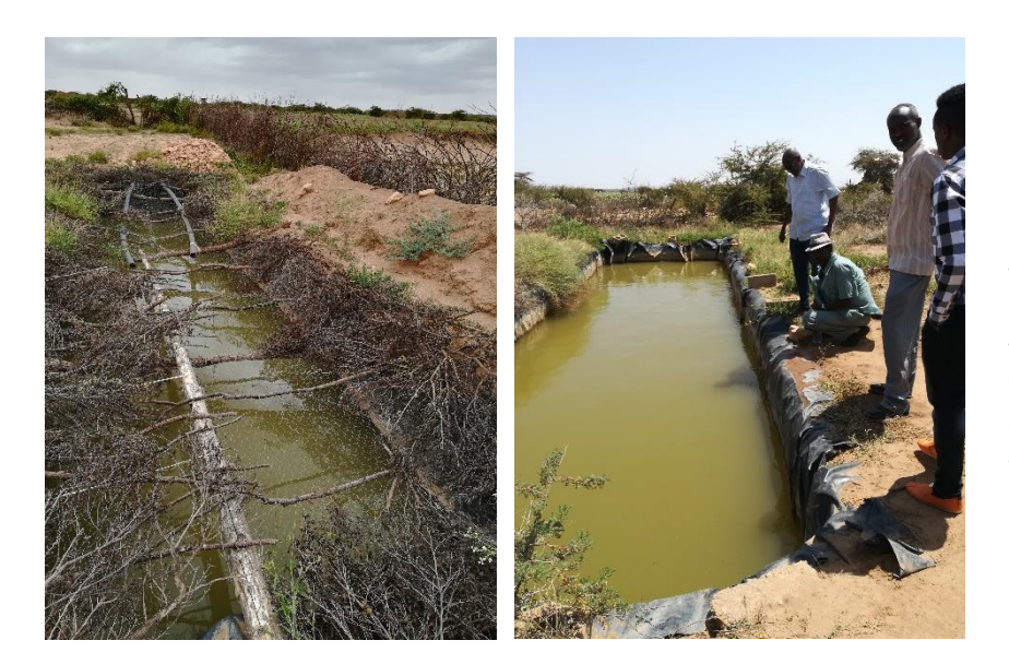
Figure 9 - Water basins lined with plastic sheet with (left) or without (right) cover (to reduce evaporation). These structures are located beside tree orchards or gardens and provide water for irrigation during dry spells or the longer dry season.