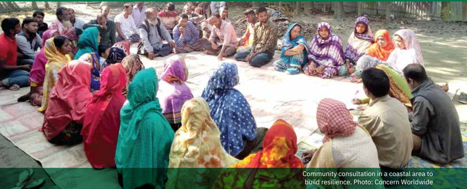
Community consultation in a coastal area to build resilience.

Concern Worldwide is an international humanitarian organisation dedicated to the reduction of suffering and working towards the ultimate elimination of extreme poverty in the world's poorest countries.