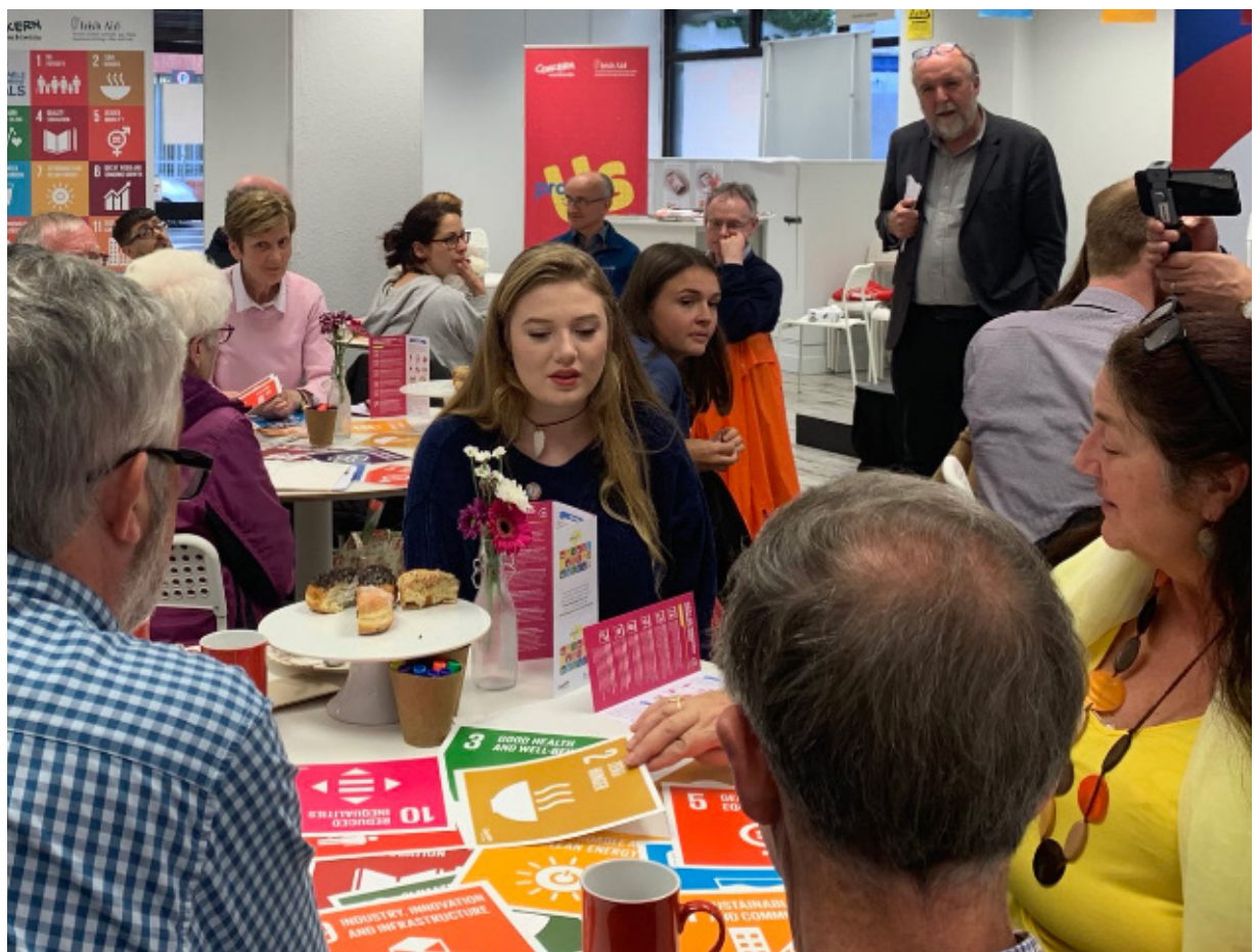
Project Us Café with Waterford One World Centre, March 2018 Project Us Café with Age Action Ireland, October 2019