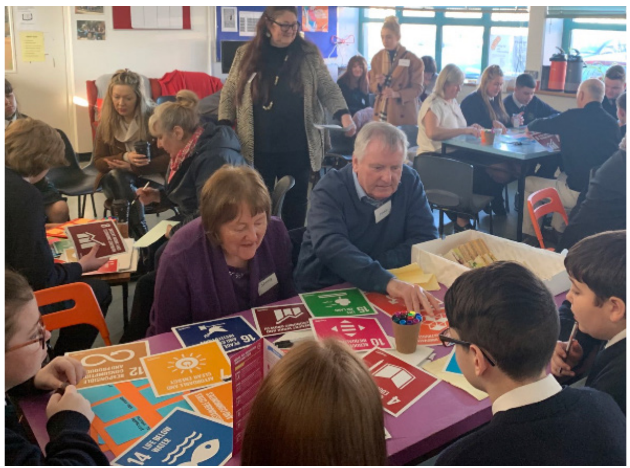
Participants at Project Us 'intergenerational' café with Age Action Ireland, September, 2019