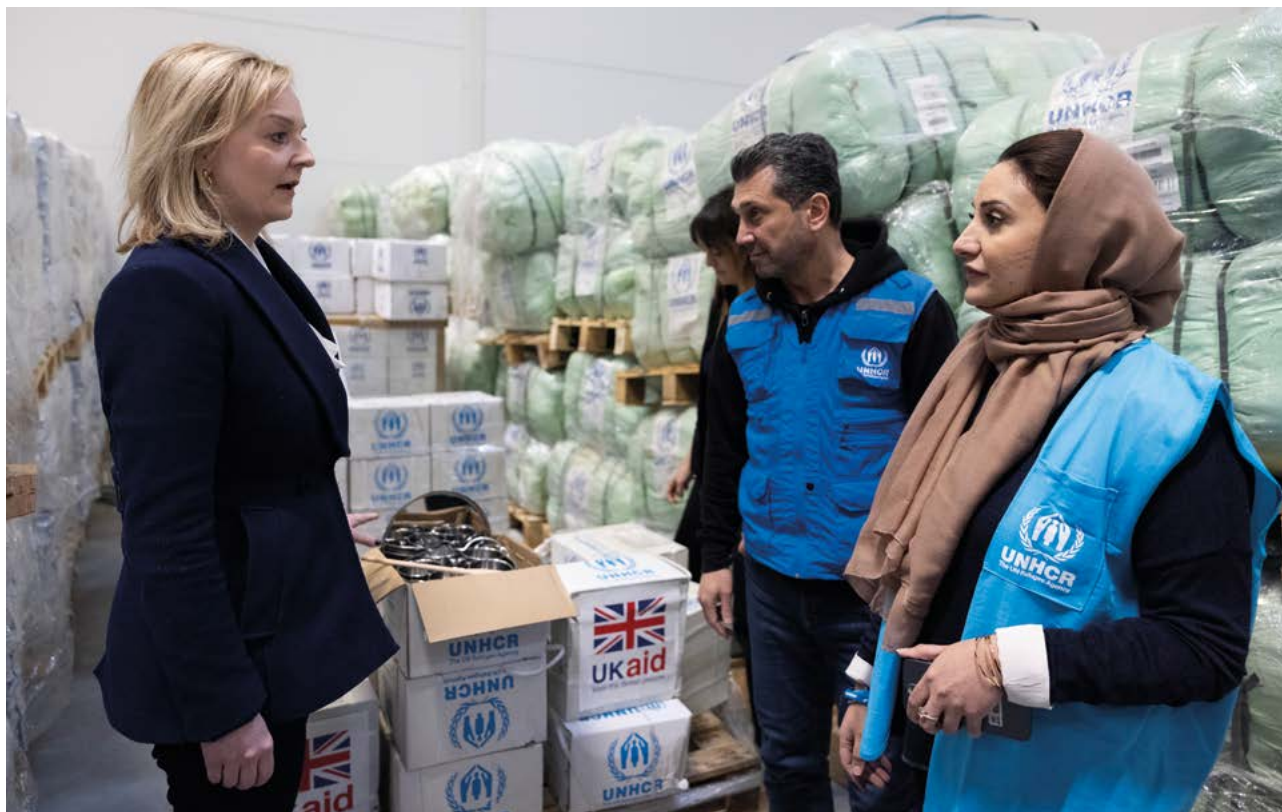
Foreign Secretary Liz Truss visiting a UNHCR warehouse to look at humanitarian aid being sent to Ukraine.

18. The UK is a global leader in driving more effective approaches to crises. We have led international efforts to strengthen crisis solutions and reduce humanitarian need. As a champion of digital cash payments, we have made humanitarian responses faster and more effective. Drawing on our expertise in disaster risk financing and insurance, we have helped to set up all four of the world's regional insurance schemes, enabling rapid responses that save lives and livelihoods.