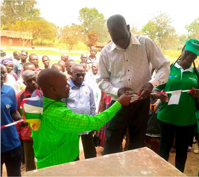
Ribbon cutting of a new market built thanks to Concern in south-eastern CAR.

“We will have an abundance of food and for a good price.”