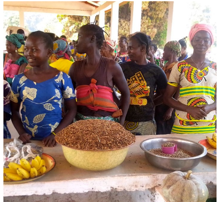
Merchants selling their products at a new market as part of a socio-economic recovery programme in south-easter CAR.

Concern has been working in CAR since 2014 and in 2024, Concern CAR maintained its commitment to addressing intersectional inequality, and integrated gender-transformative approaches into 50 per cent of its projects. Concern's programmes in CAR implement activities in both development and emergency contexts, the team addressed critical nutrition needs in vulnerable rural and conflict affected communities across CAR, worked on improving access to clean water and hygiene