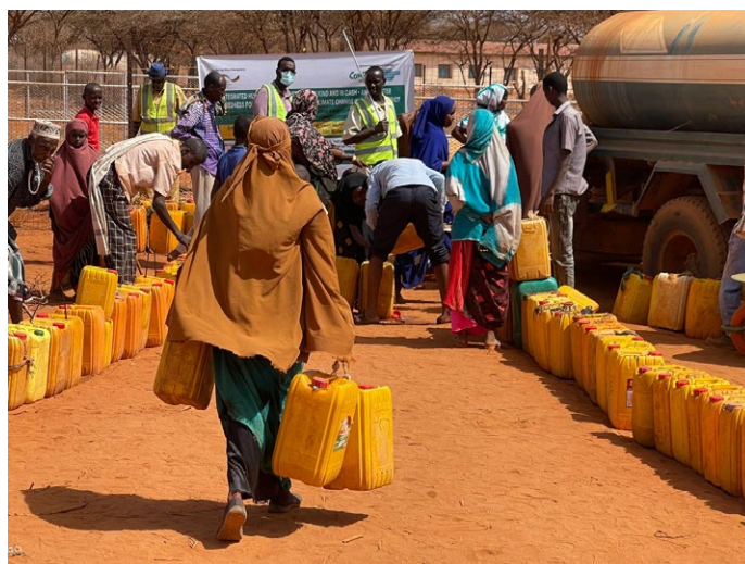
A Somali woman walks to Concern's water truck to fill up her containers for her family in Odweyne in the Togdheer district where water sources have dried up due to drought.

The Emergency Programme has focused on life-saving activities to address humanitarian needs of flood- and conflict-affected population. $100 a month have been provided to crisis-affected families via digital money transfers that are sent to eligible programme participants without any strings attached. This will support them to withstand the current shocks through – for instance – accessing markets to purchase food and other basic needs, including water, medicine and shelter.