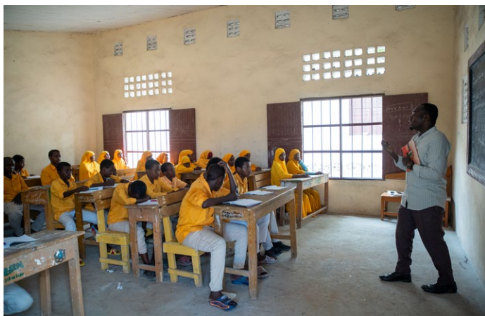
View from 21 November School in Mogadishu.

In 2024, the education programme aligned its priorities around safe access to education, quality learning, and overall students'/teachers' wellbeing with multiple strategies funded through three projects across its operational areas. Concern employed a thematic approach to advance inclusive and equitable education by means of the following initiatives: