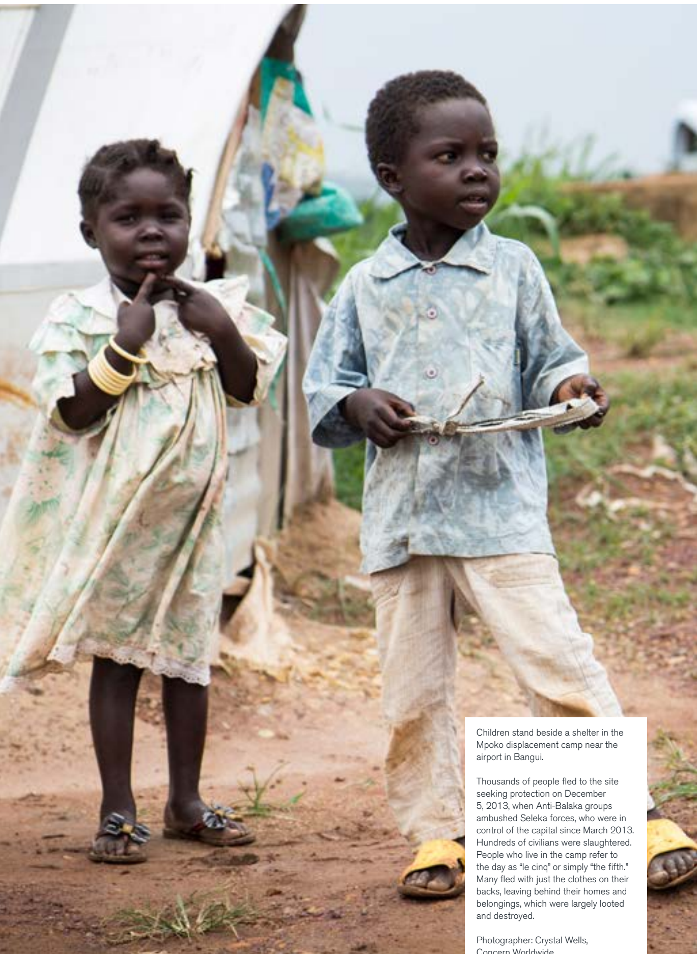
Children stand beside a shelter in the Mpoko displacement camp near the airport in Bangui.

Thousands of people fled to the site seeking protection on December 5, 2013, when Anti-Balaka groups ambushed Seleka forces, who were in control of the capital since March 2013. Hundreds of civilians were slaughtered. People who live in the camp refer to the day as "le cinq" or simply "the fifth." Many fled with just the clothes on their backs, leaving behind their homes and belongings, which were largely looted and destroyed.