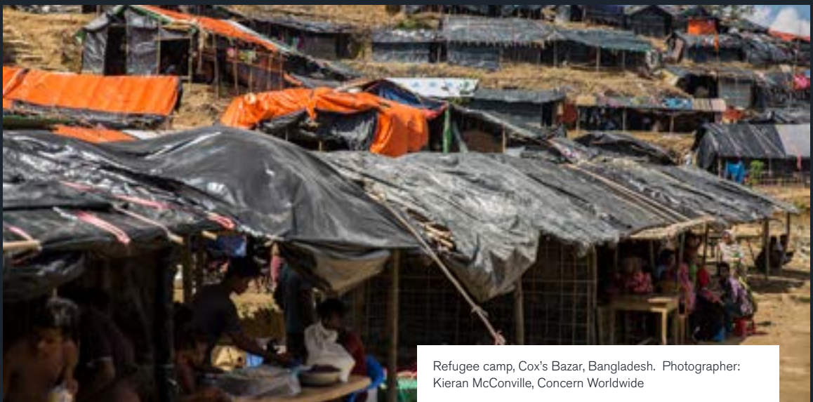
Refugee camp, Cox's Bazar, Bangladesh.

* All names have been changed for security purposes