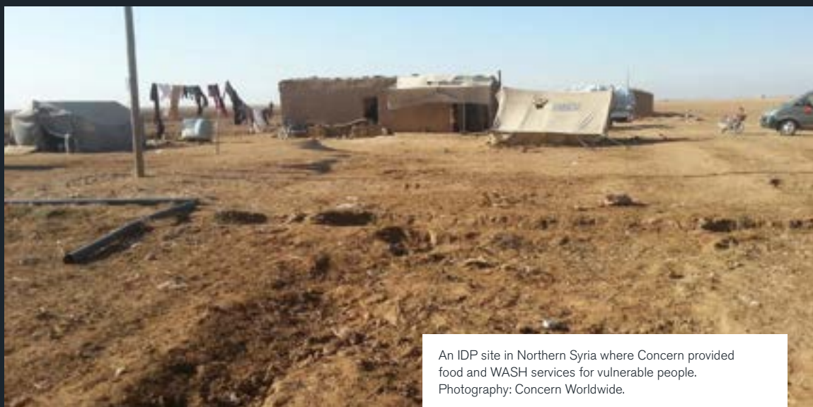
An IDP site in Northern Syria where Concern provided food and WASH services for vulnerable people.

* All names have been changed for security purposes