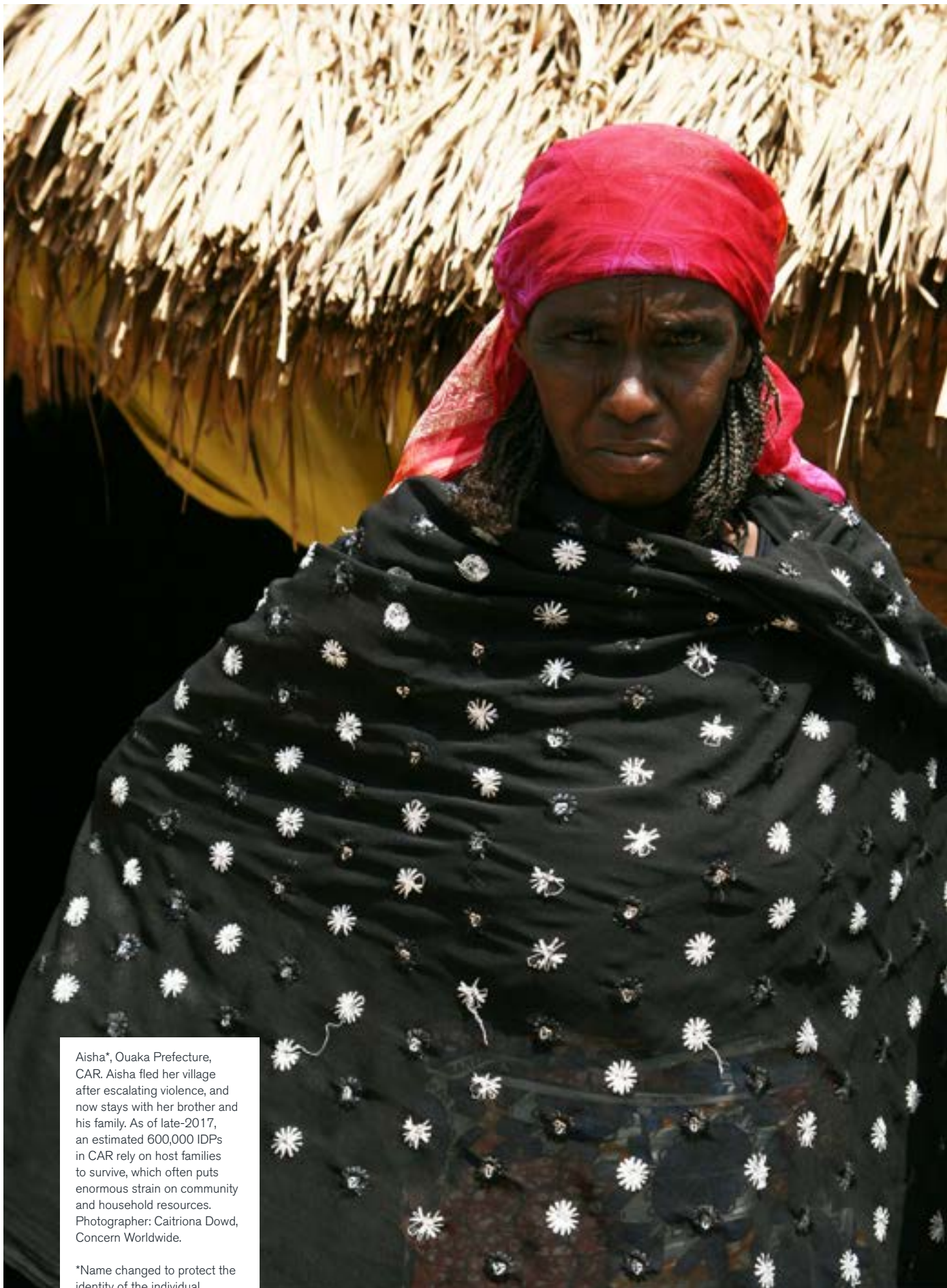
Aisha*, Ouaka Prefecture, CAR. Aisha fled her village after escalating violence, and now stays with her brother and his family. As of late-2017, an estimated 600,000 IDPs in CAR rely on host families to survive, which often puts enormous strain on community and household resources.

*Name changed to protect the identity of the individual.